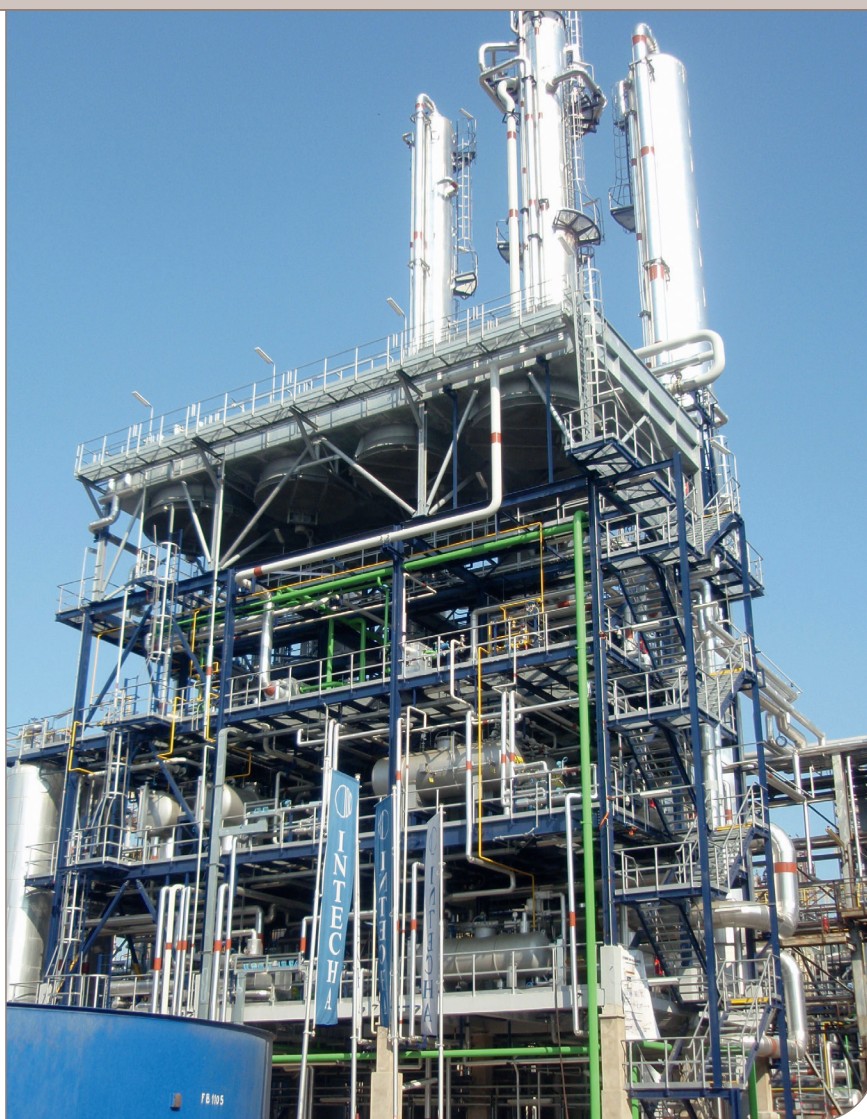
At Unipetrol RPA Ltd. in Litvínov, 13 Alfa Laval Compabloc heat exchangers in stainless steel are installed in the new benzene production unit.

Since S&T heat exchangers equipped with stainless steel tubes would have been more costly than Alfa Laval Compablocs with their smaller heat transfer area, the Compablocs were chosen.