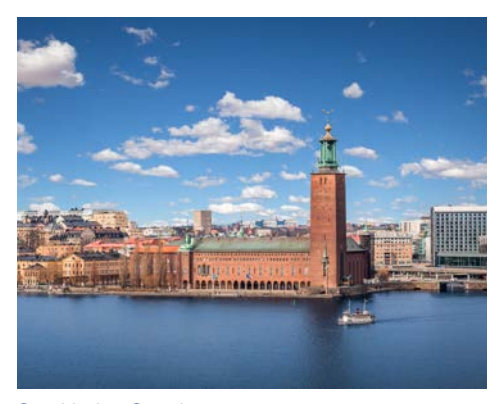
Stockholm, Sweden: Learn how to improve safety and take control of operations.