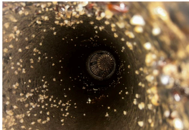
LT cooler with Sonihull