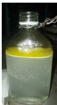
With non-genuine parts: Cooling water sample with soybean oil loss shown on top.

“I know that I can rely on genuine Alfa Laval parts to last much longer than parts from local suppliers,” Mr. Gaikwad says. “I know that operations will be safe, reliable and trouble free.”