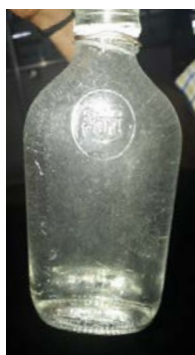
With Alfa Laval parts: Cooling water sample with no oil loss.