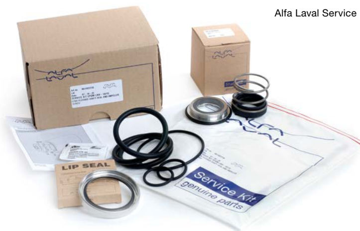
Alfa Laval Service Kits.